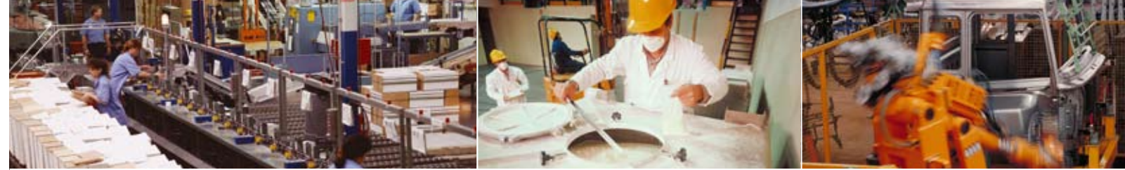
B-SX6 & B-SX8

All of Toshiba's new generation of thermal printers for the industrial environment are RFID ready. This provides not only essential flexibility for the end-user to choose the RFID module that best meets the needs of their business and suppliers, but also ensures a future-proofed printing solution that can evolve and grow with the future demands of the organisation.